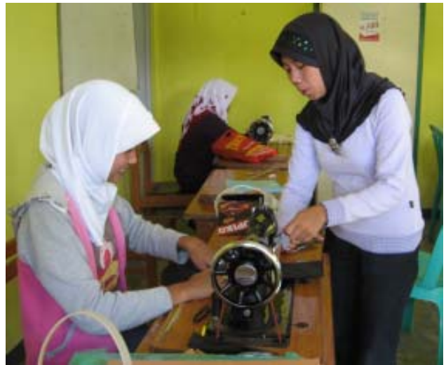
Local woman receiving sewing training at the Children's Village

The Village has expanded the sewing course that it offers to local women so that even more can now benefit from the program. The course teaches women sewing skills so that they can produce a range of products to sell to increase their income.