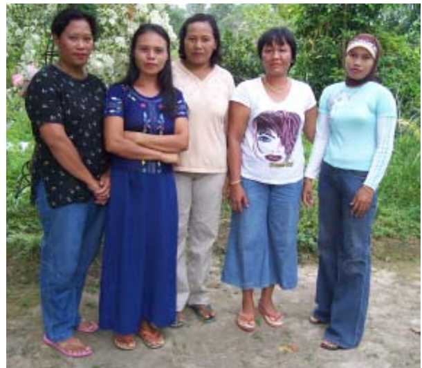
New micro-credit recipients were made possible by the generous support of Susila Dharma Canada