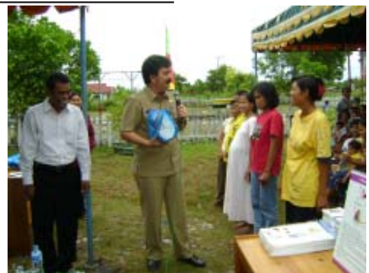
Women in Kalimantan receiving mosquito repellent bed-nets

The Malaria Control project which is complemented by clean drinking water installations in three villages and a community-led total sanitation program (latrines) is of great importance for the health