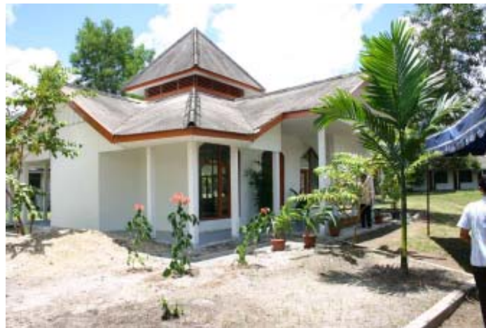
New YUM office in Central Kalimantan