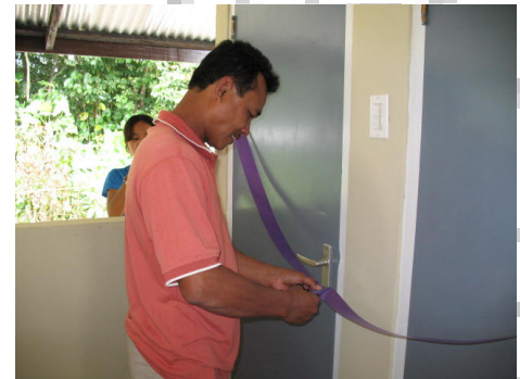
Opening of restroom facilities in Subud Accaribo.

In the weekend of 16-17 August 2008 the roof of Subud House Paramaribo was replaced. The old roof of corrugated iron sheets had gone rusted with the consequence that rainwater penetrated the ceiling and did great damage. The renovation was made possible by the financial contributions of the Subud members during a year. Thank you all for your generosity.