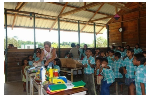
A school in Palumue (interior of Suriname).