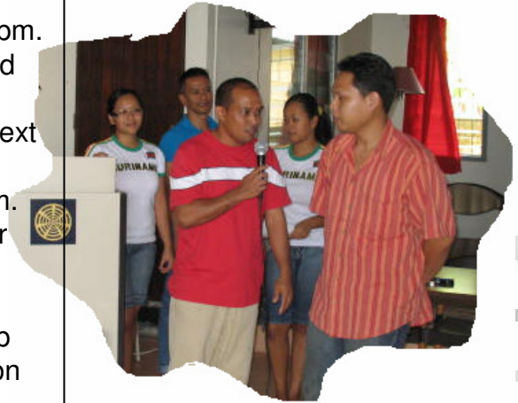
Youth and Culture in action.

The next day (Saturday) the latihan began at 8.30 am. We continued the second part of the meeting an hour later. It was the turn of the committee members of Subud Lelydorp and Subud Accaribo to present their report. Both committees have the intention to develop more of their surroundings through the implementation of several activities in 2009. Accaribo mentioned a clean-up of the environment to improve their surroundings. The members of Lelydorp work hard to realize a new Subud House.