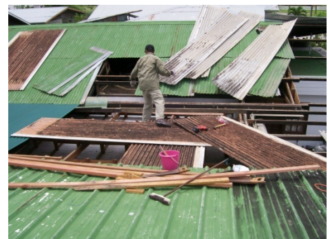
Removing old sheets on the roof.