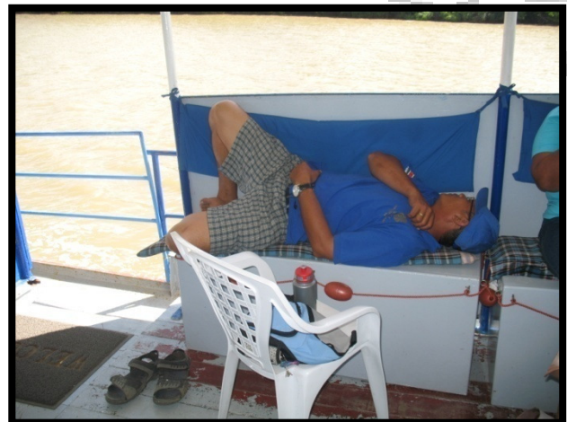
Demonstrating the importance of relaxation after hard work.