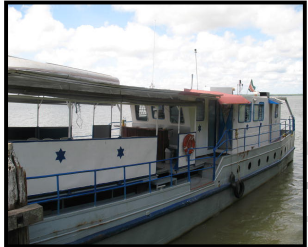
The "Sweet Merodia"