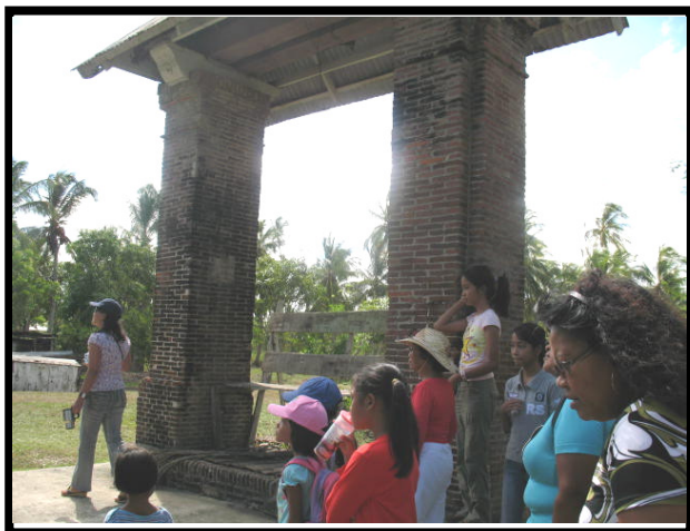
Admiring the surroundings .

We went down the river with to our right the District of Commewijne. Well known places on this side of the Suriname river are Belwaarde, Lust en Rust, Zorgvliet, Voorburg and Nieuw Amsterdam. At the junction of the Suriname and the Commewijne river, the water was rather turbulent. That was the reason for us to make noises as if we rode in a carousel, a Merry-Go-Round.