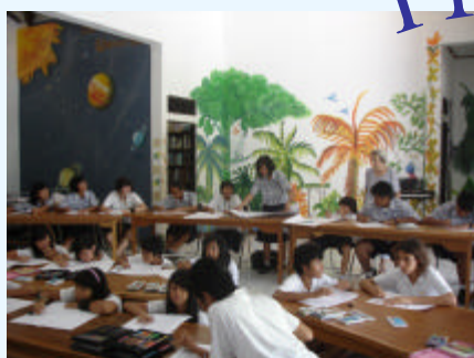
Visiting students from Palangka Raya and BCU Students