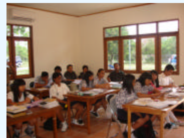
BCU and Palangka Raya students inside and outside the new class rooms

More good news is that Hamid and Isti da Silva have offered to make a donation which will enable BCU to build two further class rooms. With these extra facilities we hope that we can accommodate more pupils and get close to a financial breakeven situation in 2010.