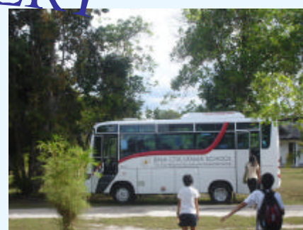
School Bus donated by Japanese Subud members