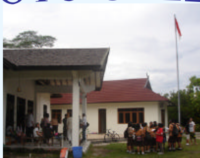
New Classrooms (above, background) and Grade 1 Students (below)