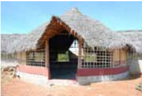
The Centre for Culture and Development, Madurai, India.