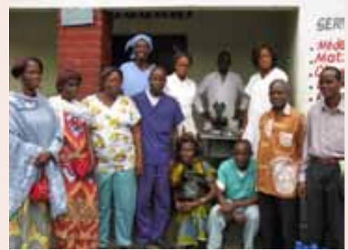
The staff of Yenge Health Center in D.R. Congo serve a wide community.

“We want to confirm that the motorcycle will allow us better to accomplish our functions as a Health Centre with a community of 19,064 inhabitants, mainly very poor families, in vaccination-delivery, training in disease prevention and emergency care. Many thanks to the owners and staff of Dharma Trading (USA) who have made the purchase of this motorcycle possible!”