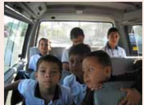
A new bus for the children at Fundacion Amanecer, Colombia.

In 2008, SDIA began a cycle of capacity building workshops in the Democratic Republic of Congo (DRC) to help strengthen SD DRC and all the SD projects there. Already by 2009 and in early 2010, there has been an improvement in communications with and management of SD DRC and several projects.