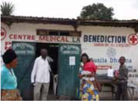
Lemba Imbu Clinic will pilot the community health center model in 2010.