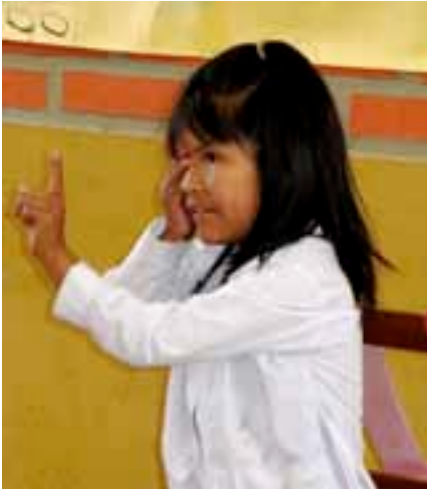
Children's Vision provides glasses to children in Bolivia.