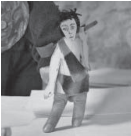
Cain slays Abel Puppeteers Without Borders, France