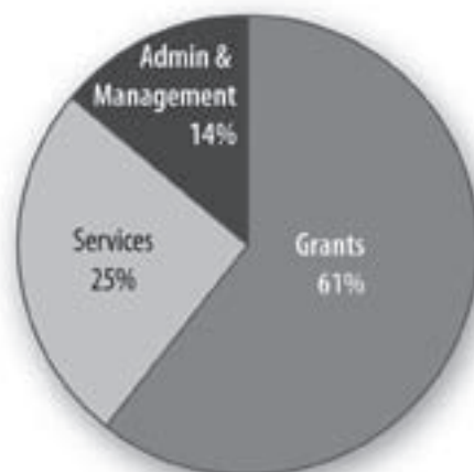
SDIA EXPENDITURES 2007 (TOTAL $190,953)