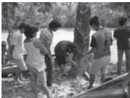
Learning rubber tree cultivation YTS, Kalimantan