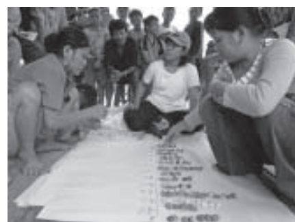
PRA Community planning YTS Project, Kalimantan