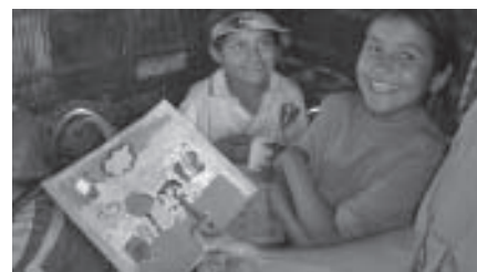
My Neighborhood, USA