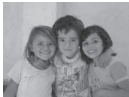
Three friends Comunidad las Calles, Argentina

Americas: Fundacion Despertar (Argentina), Child's Garden of Peace (Brazil), Fundación Amanecer, Fundación El Refugio, Fundación Educativa Amor (Colombia), Fundación Vida Plena (Paraguay), My Neighborhood International, Seven Circles Retreat Center, Teen Moms & Tuning In (USA).