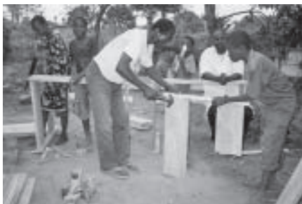
Alabadi School construction, DR Congo

Europe: International Child Development Programme (Norway—activity in 18 countries in Europe, Africa and Latin America), Lewes New School (UK), Puppeteers Without Borders (France), Roda Viva (Portugal), School Without Violence (Serbia).