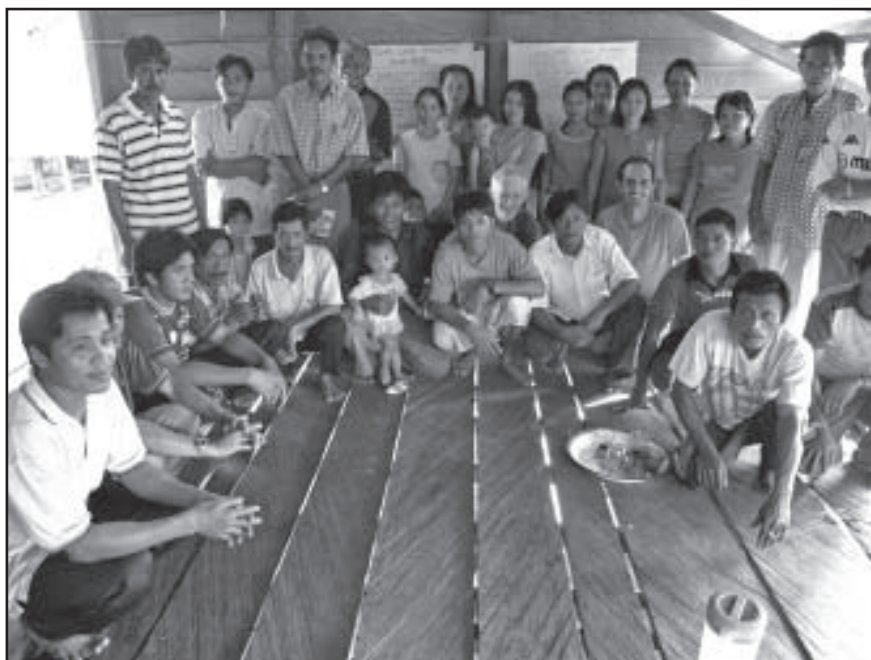
Yayasan Tambuhak Sinta (YTS) assists with village development in Central Kalimantan, Indonesia.

The Association was founded in 1969 and is an affiliate organisation of the World Subud Association. Susila Dharma International is a US-registered non-profit organisation that holds special consultative status with the United Nations Economic and Social Council (ECOSOC), UNICEF and Department of Public Information (DPI). US Charitable tax No. 98-0156249.