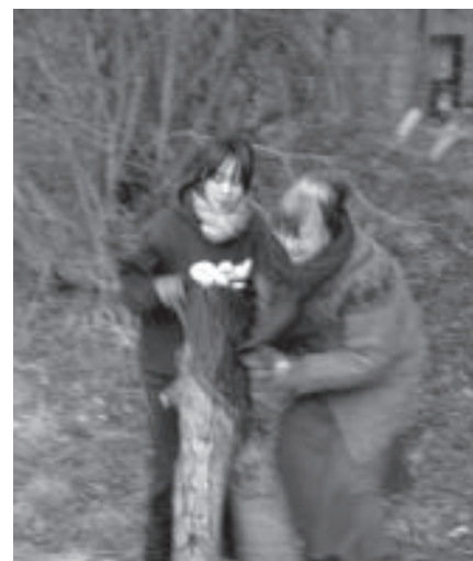
Volunteer working meeting SD Britain