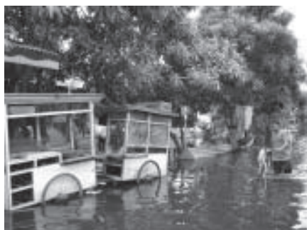
Jakarta Floods, February 2007