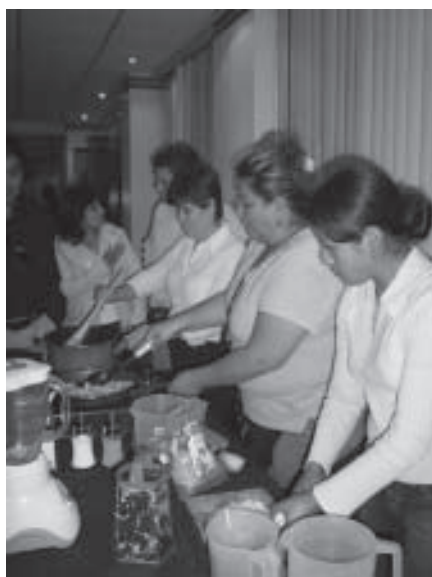
Asociacion Vivir nutrition program, Ecuador