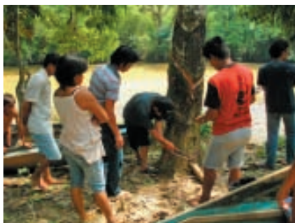
Learning rubber tree cultivation YTS, Kalimantan