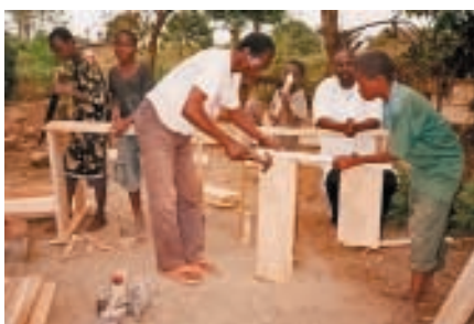
Alabadi School construction, DR Congo

Europe: International Child Development Programme (Norway— activity in 18 countries in Europe, Africa and Latin America), Lewes New School (UK), Puppeteers Without Borders (France), Roda Viva (Portugal), School Without Violence (Serbia).