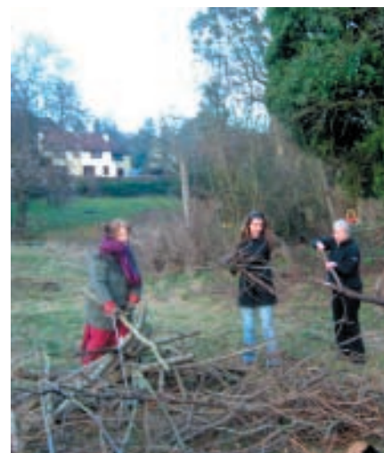
Volunteer working meeting SD Britain