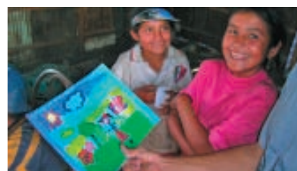
My Neighborhood, USA