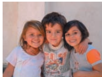
Three friends Comunidad las Calles, Argentina

Americas: Fundacion Despertar (Argentina), Child's Garden of Peace (Brazil), Fundación Amanecer, Fundación El Refugio, Fundación Educativa Amor (Colombia), Fundación Vida Plena (Paraguay), My Neighborhood International, Seven Circles Retreat Center, Teen Moms & Tuning In (USA).