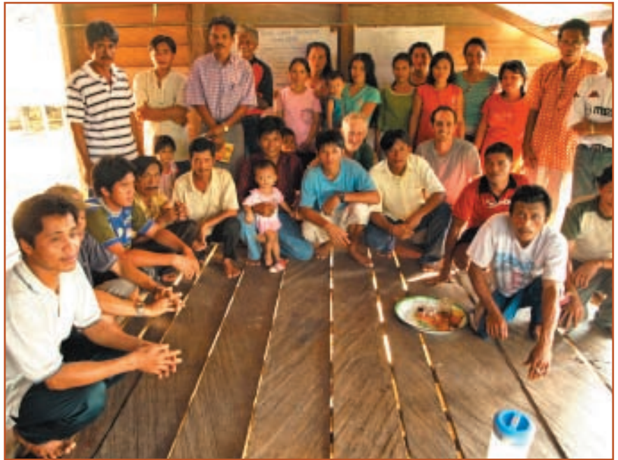
Yayasan Tambuhak Sinta (YTS) assists with village development in Central Kalimantan, Indonesia.

The Association was founded in 1969 and is an affiliate organisation of the World Subud Association. Susila Dharma International is a US-registered non-profit organisation that holds special consultative status with the United Nations Economic and Social Council (ECOSOC), UNICEF and Department of Public Information (DPI). US Charitable tax No. 98-0156249.