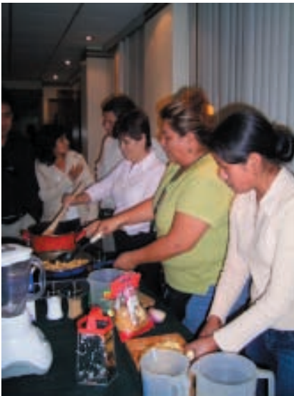
Asociacion Vivir nutrition program, Ecuador