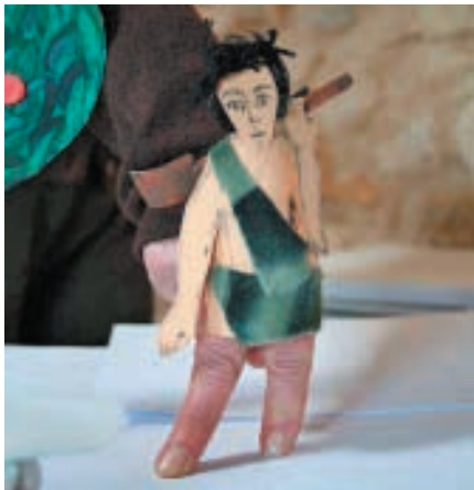
Cain slays Abel Puppeteers Without Borders, France