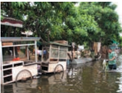
Jakarta Floods, February 2007