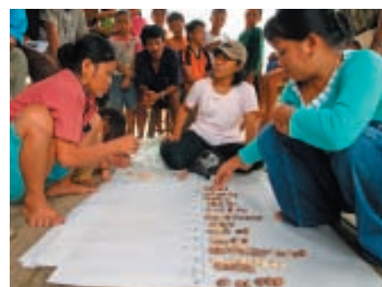
PRA Community planning YTS Project, Kalimantan